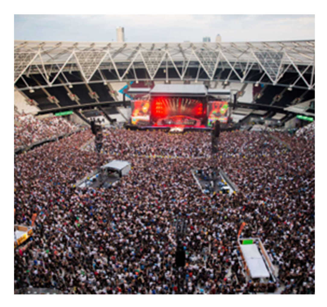
Concerts at the London Stadium 2024

The London Stadium, formerly known as the Olympic Stadium, is a multipurpose stadium located in the Queen Elizabeth Olympic Park in Stratford, London, United Kingdom.