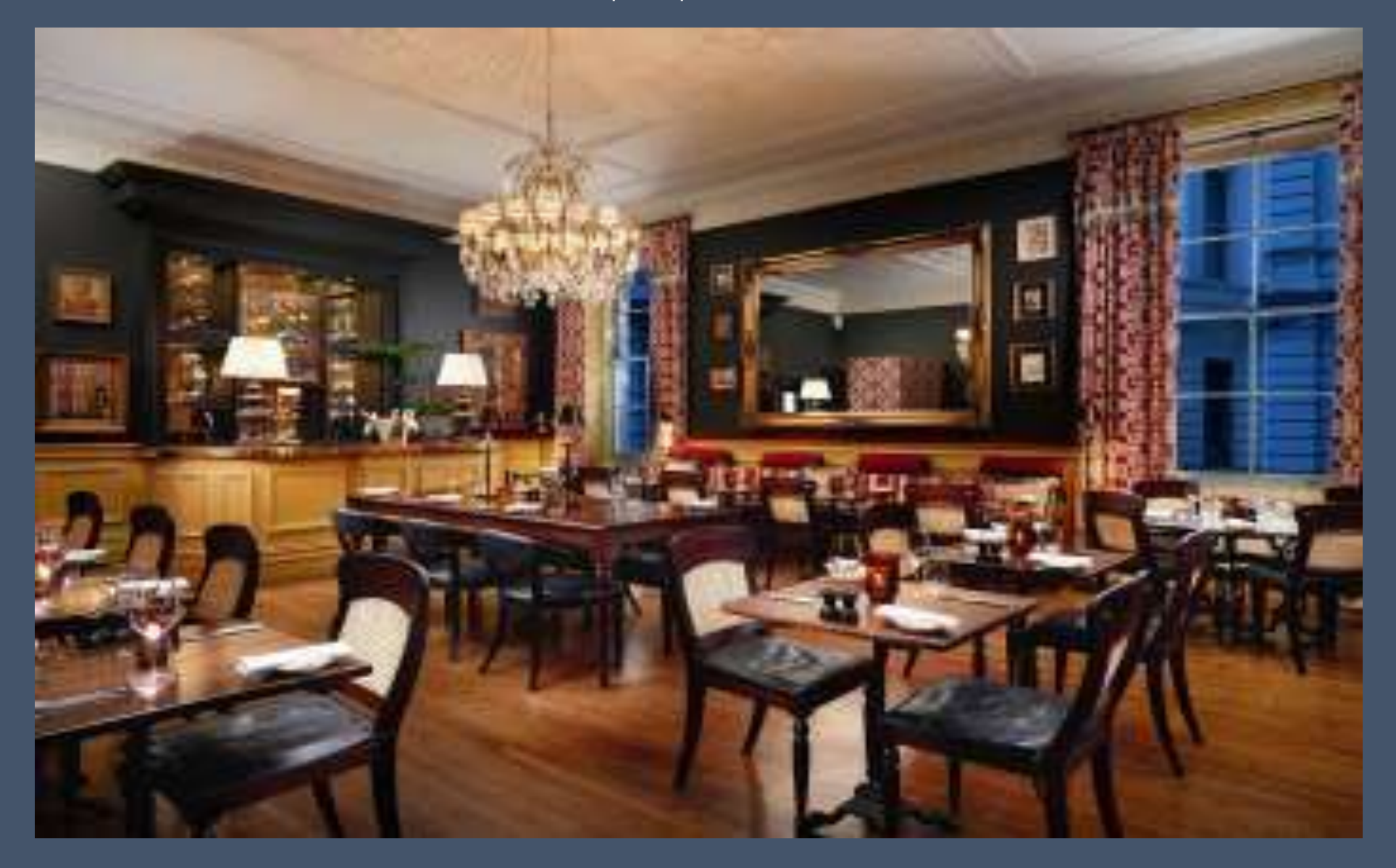
The restaurant at 190 Queen's Gate ideal for both pre & post-concert dinner