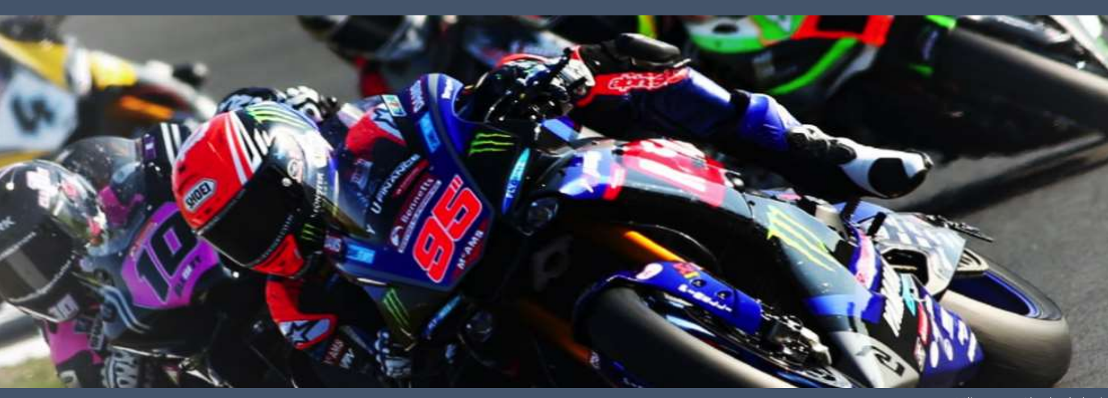
2022 BENNETTS BRITISH SUPERBIKE CHAMPIONSHIP

Official Hospitality Packages Silverstone Circuit - Friday 15 - Sunday 17 APRIL 2022