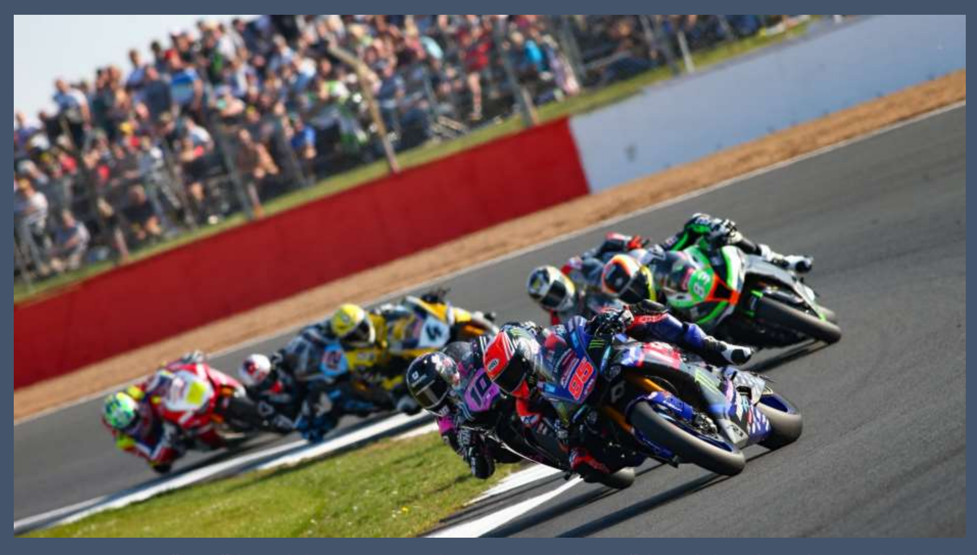
All offered Official Hospitality products are supplied by MATCH Hospitality, the Official Hospitality Provider to Silverstone Circuits Limited